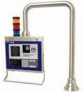
Touch Screen System Interface