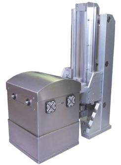
Tablet Print Inspection Head